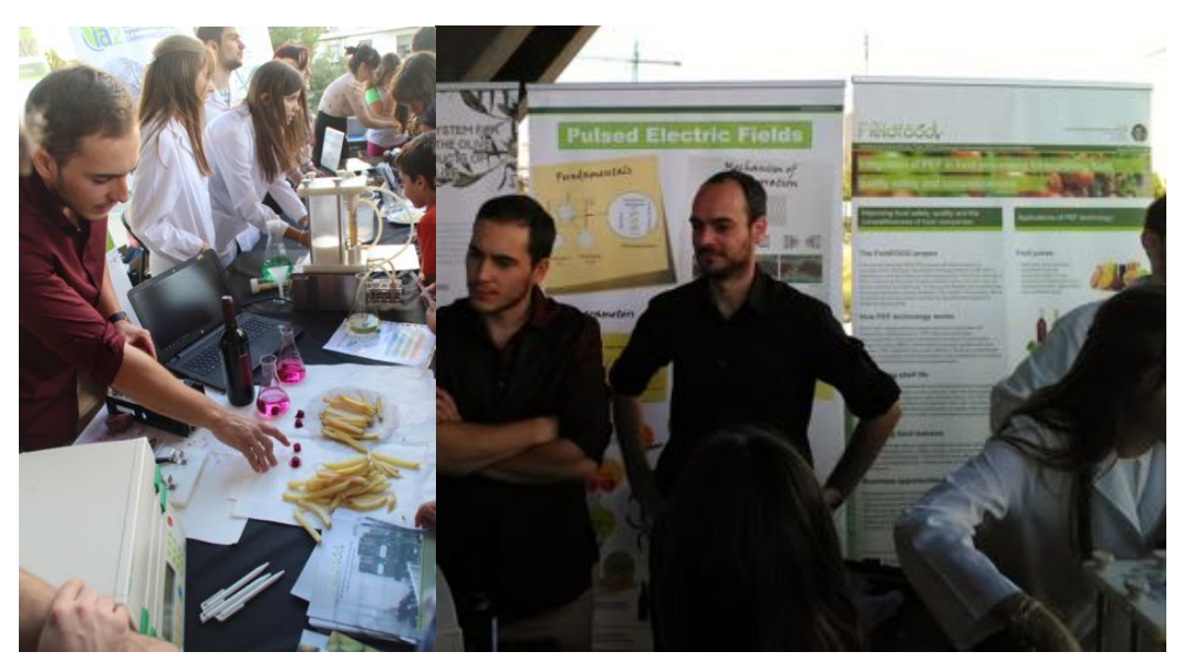
Researchers' Night 2016 of Zaragoza (Spain).

Integration of PEF in food processing for improving food, quality safety and competitiveness